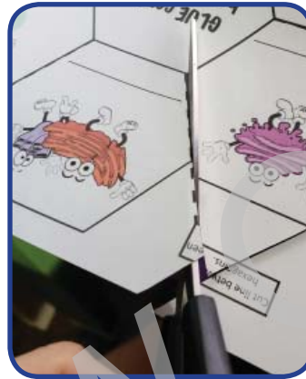
Cut out between hexagons