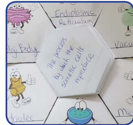
Fill in information