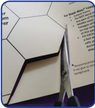
Cut out frame