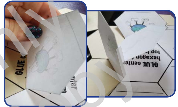
Fold IN hexagons